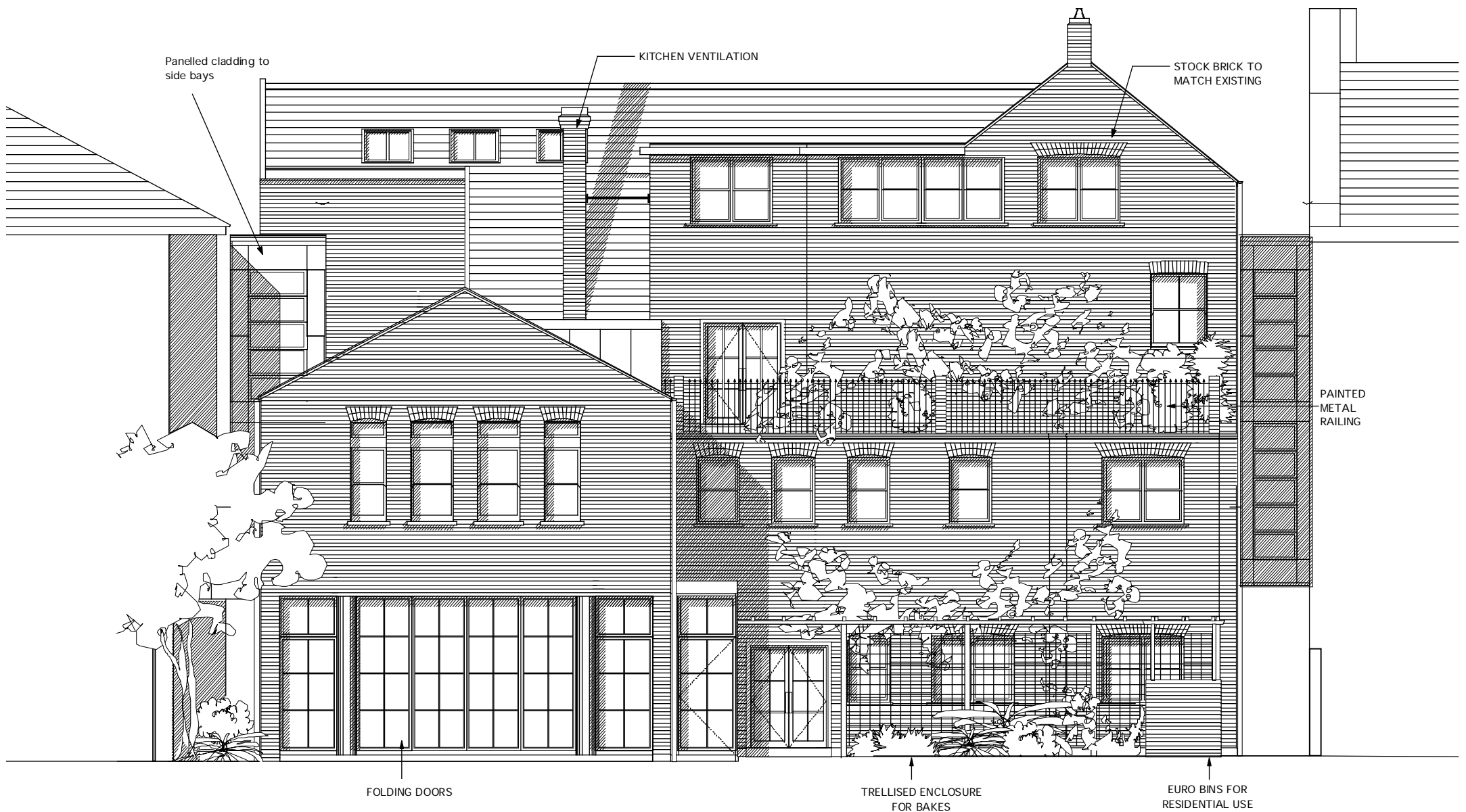
1 REAR ELEVATION 113 Scale 1:100