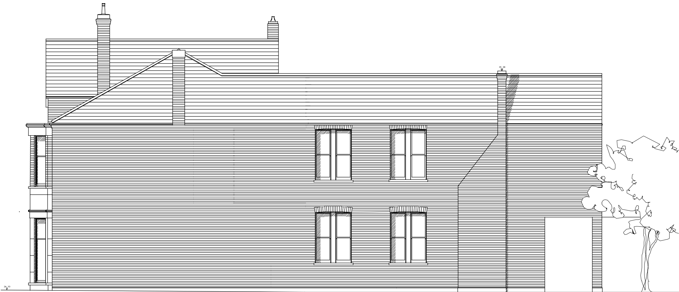
1 SOUTH - EAST ELEVATION 104 Scale 1:50