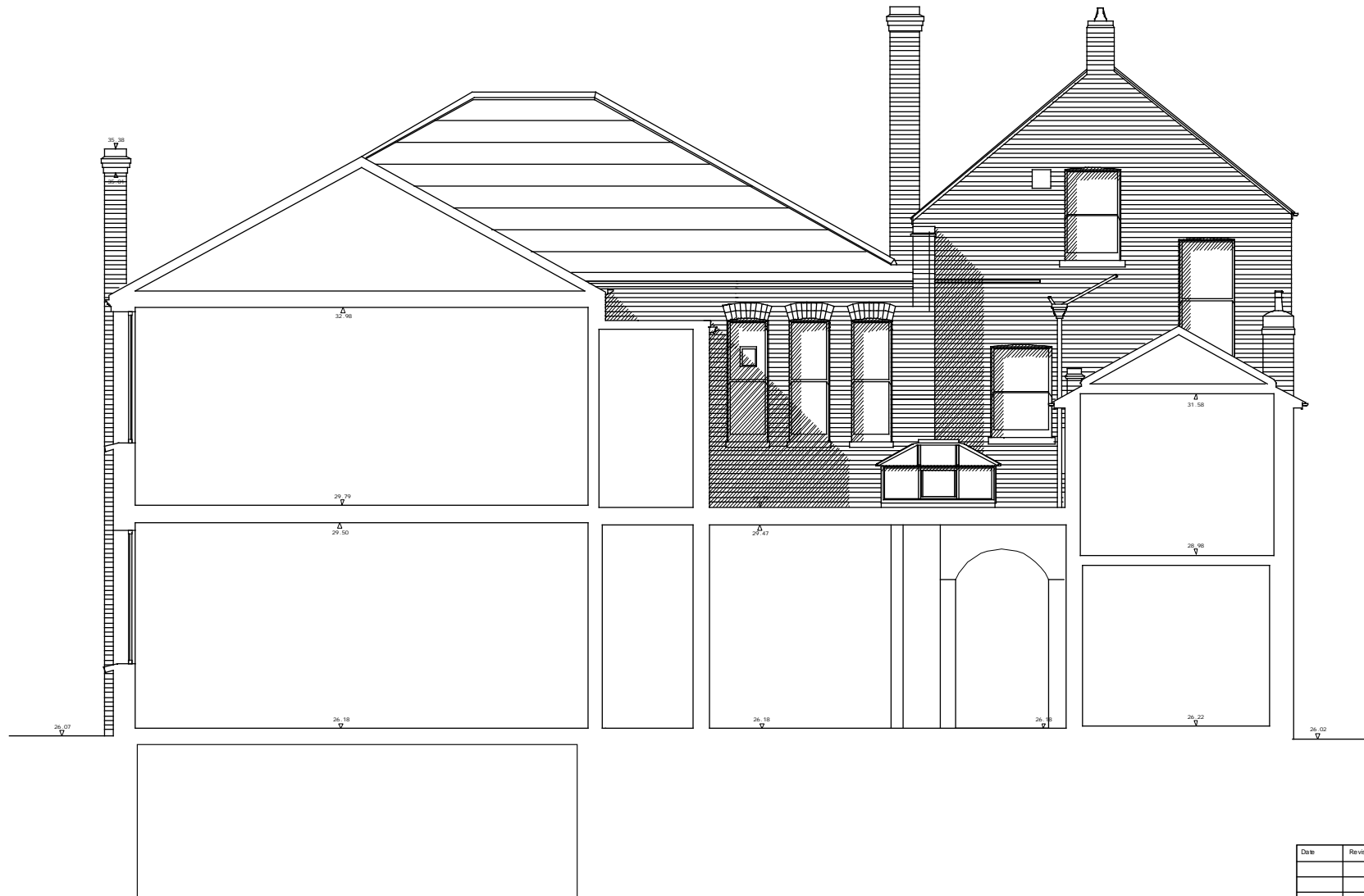
2 SECTION B-B 105 Scale 1:50